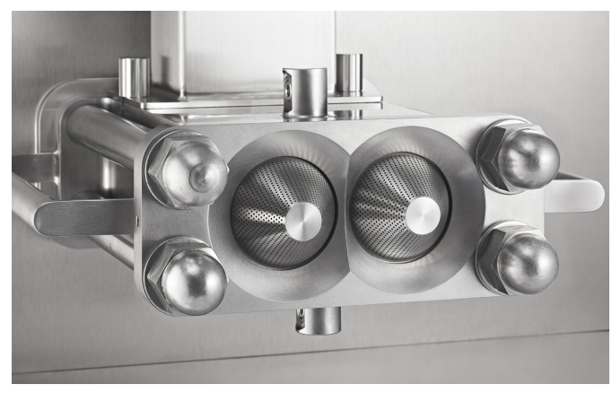
Extruder screw system detail showing the triple compression system for the axial die configuration

Improved extrusion technology with the caleva cone system (compared to dome systems). Consistent dies holes and pressing cam to screen distances. Minimal flexing during operation. Triple compression extrusion using Caleva cone dies.